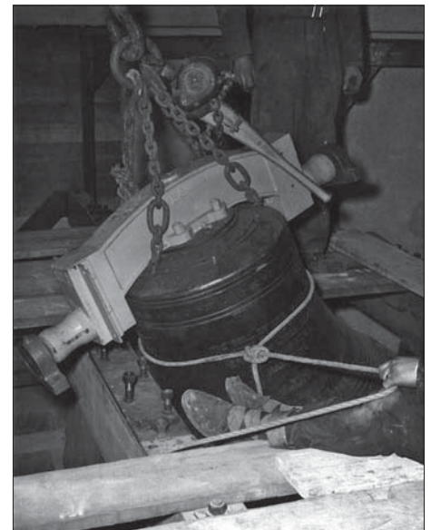
The new Great Bell of Bow arrives in the belfry