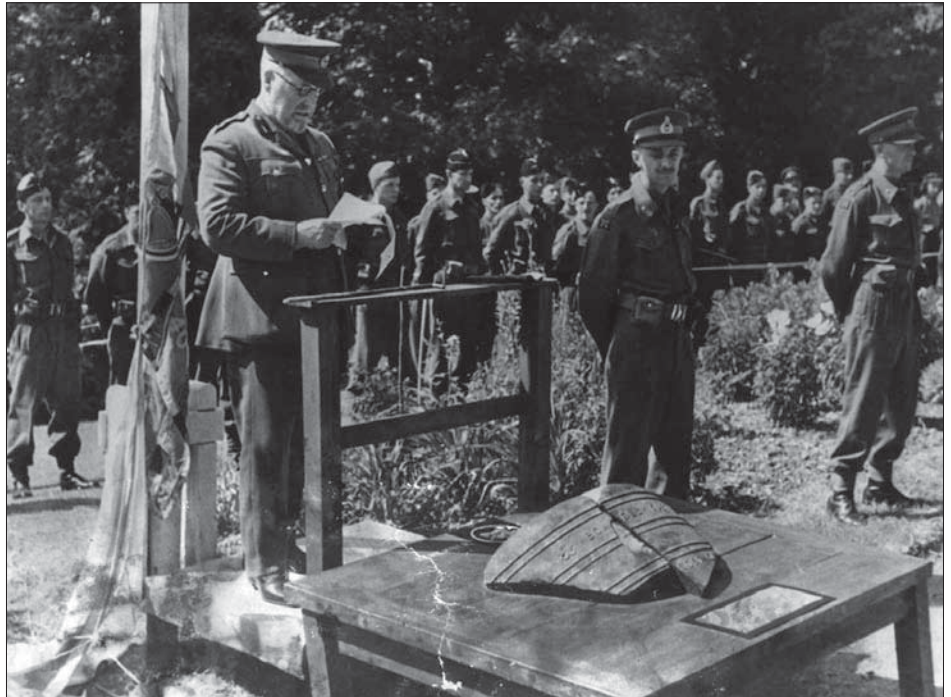
Members of the Armed Forces asking for support for the new bells in 1956