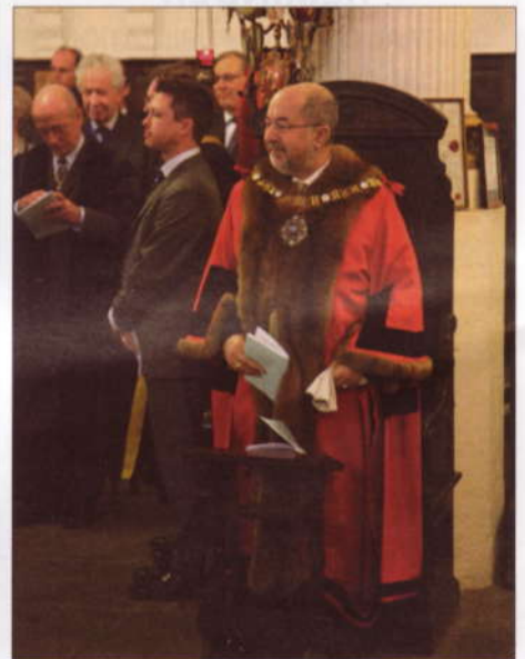
The Lord Mayor of London, Alderman Ian Luder